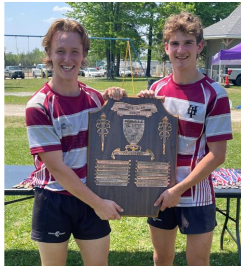
BHNCDSB is proud of our James Hillier Foundation Scholarship winners!