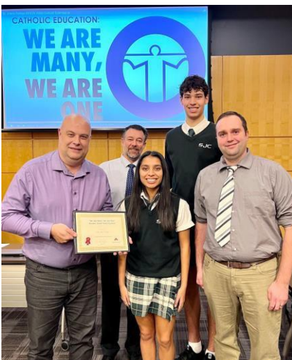
SJC Wins 2 nd Place in the OCSTA Short Video Contest