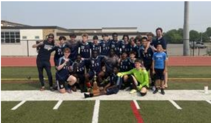
Assumption wins junior boys soccer tournament.